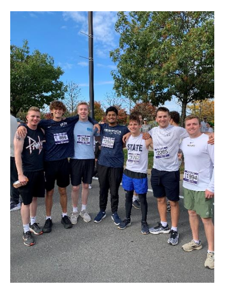
Can't Stop Won't Stop! The boys celebrate an amazing 5K run For The Kids!

Finally, the last initiative we were a part of is the THON 5K that takes place every year. This 5K rallies the State College community, raising money and support for those suffering from childhood cancer, and it's a special event to be a part of.