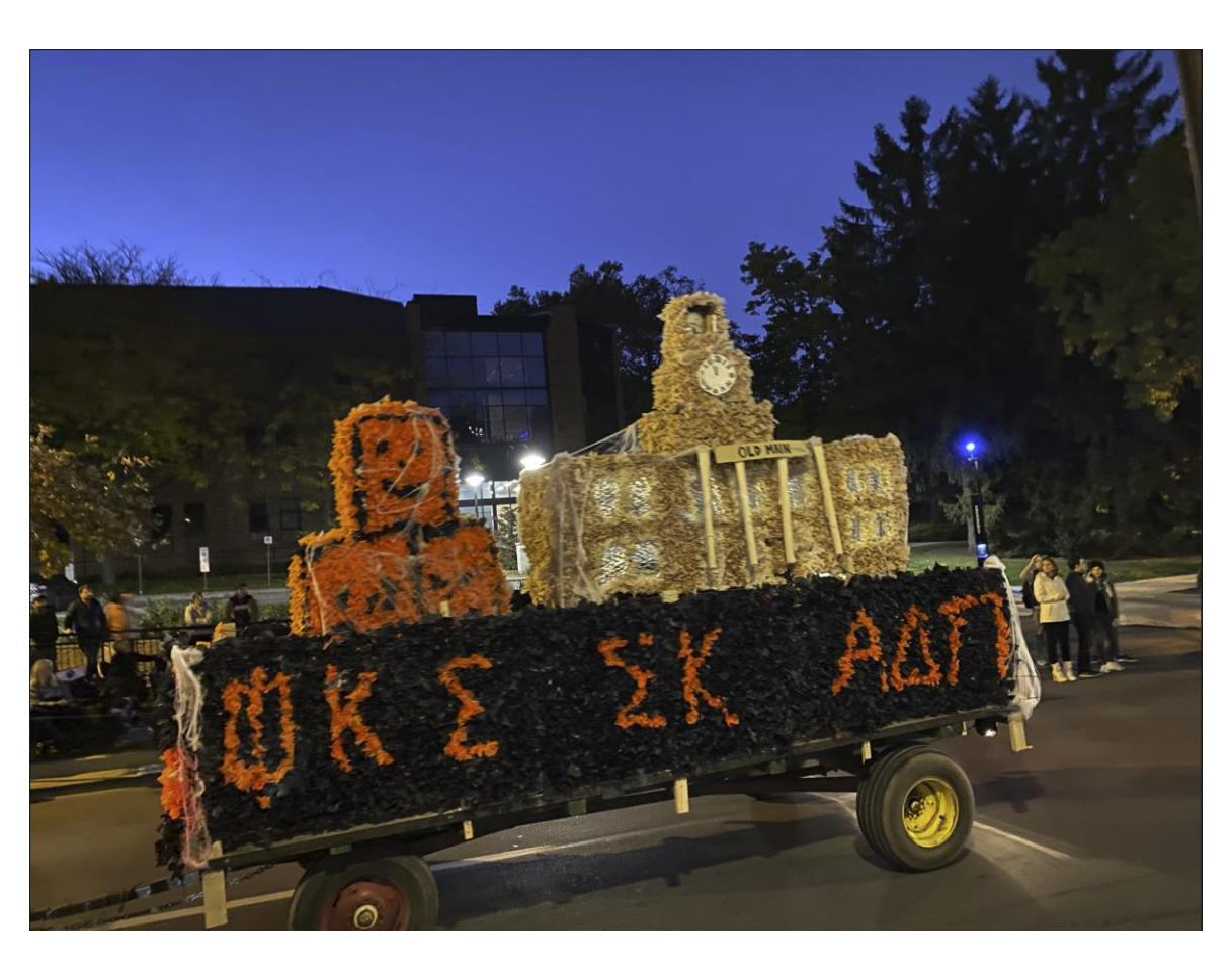
This is the full view of the float. If you look closely, there is a skull instead of a bell at the top.