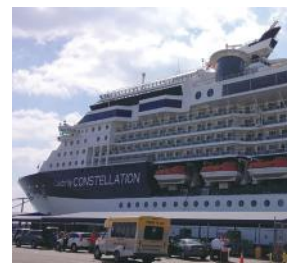
A memory from the 2014 cruise. This year's expedition will include some of the same sailors who came along on the 2014 cruise. Brothers and spouses will be sailing Royal Caribbean's “Independence of the Seas”.

but we are seeing signs of work starting on our home which had about 3 inches of water throughout. Might as well have been 3 feet.