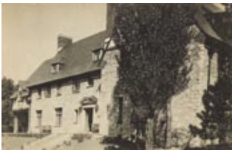
The house in 1931.

The House and the parking lot will be closed for safety reasons during the summer. Both indoor and outdoor renovations are planned.