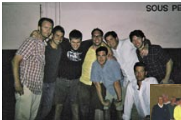
Above: 2005 Alumni Get Together in NYC.

1-800-277-7505 by June 13th, 2007 and mention either the Block Name, Phi Kappa Sigma , or the Reservation Code, PKS0713 .