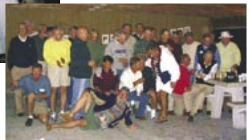
Below: The gang from the 2003 Best Years Reunion takes a break and poses for the camera.