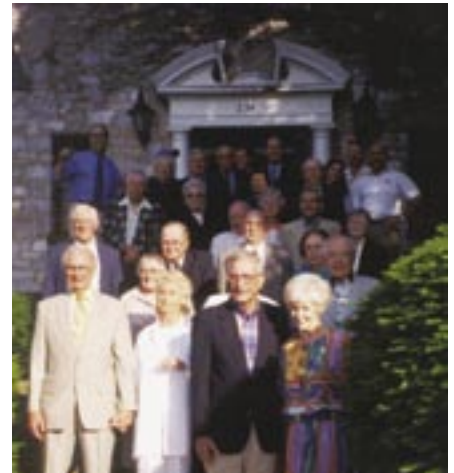
Participants in the 2002 All Classes Reunion pose for a photo in front of the House.

Inn for July 13 th and 14 th . The rate for each night is $169 plus tax (single or double occupancy). To reserve a room at this reduced rate, please call