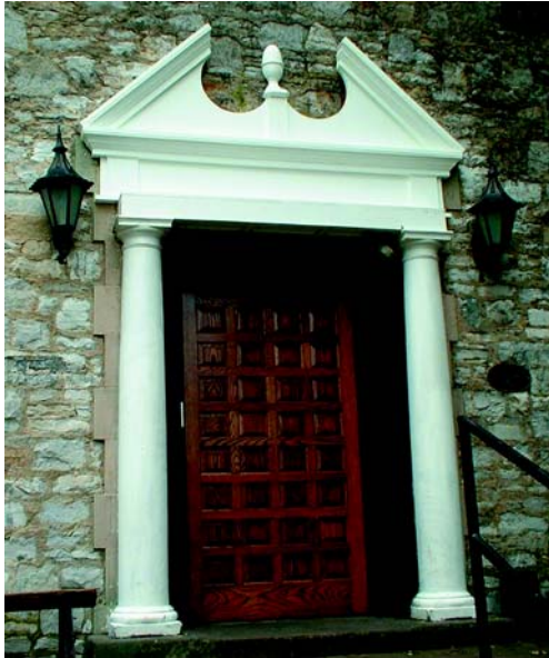
A new oak door ...

We are pleased that we have been able to make some noticeable upgrades this summer to the House. These include: