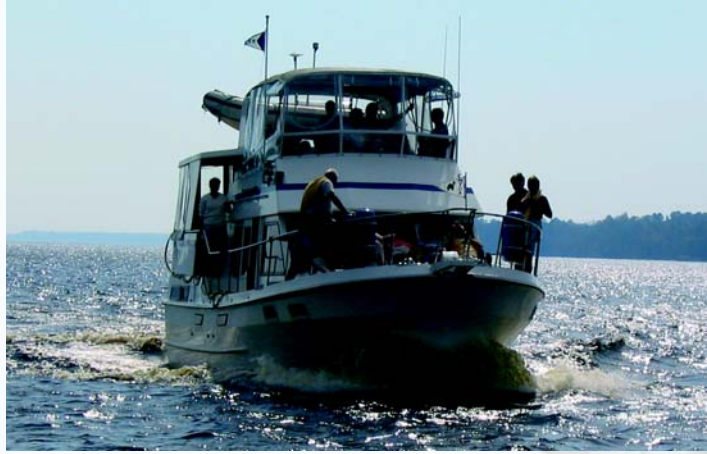
Friendship cruise ... 22 Skulls and spouses on board.