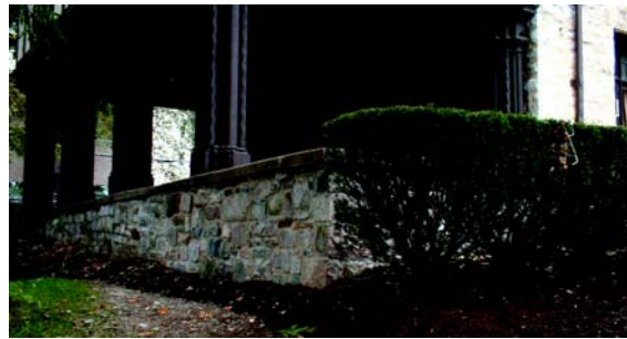
and a restored stone porch welcome visitors to the Skull House.

We also again thank Kappa Alpha for maintaining the House and