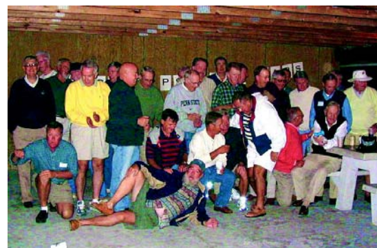
Best Years Reunion ... see pages 2 and 3 for our reunion photo gallery.